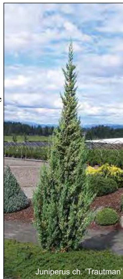
Juniperus ch. 'Trautman'

The arrival of trees and shrubs is always one of the most exciting times of year for me. And when there are so many new varieties on board, it is just that much more tantalizing. It won't be long now!