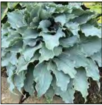
Hosta 'Dancing with Dragons'