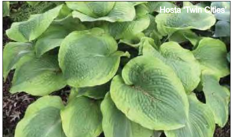
Hosta 'Twin Cities'

defined cream margins. A very unique specimen that would perhaps show off best in a container or miniature garden.