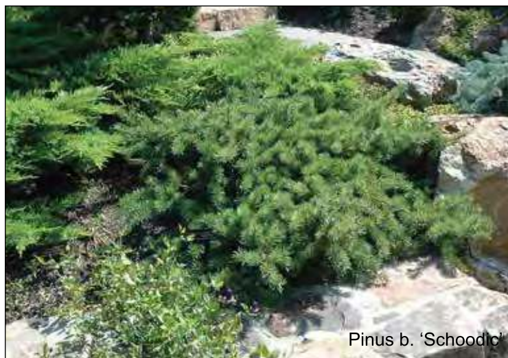
Pinus b. 'Schoodic'

Conifers: We have expanded our conifer palette with several new and interesting plants. 'Trautman' is a juniper that makes an excellent vertical accent plant similar in shape to the narrow elegance of the Italian Cypress, but hardy! It has elegant, slender form and blue-green foliage, making for a great focal point. Garden size is 15' tall and only 4' wide.