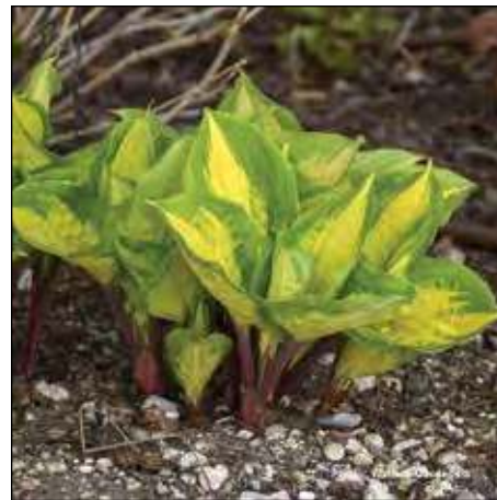
Hosta 'Island Breeze'

First came 'Fire Island', a vivid yellow hosta. Then came its sport (genetic mutation), 'Paradise Island', with its bright yellow foliage with green margins. It then sported to 'Island Breeze', which has been named the 2022 Hosta of the Year by the American Hosta Growers Association.