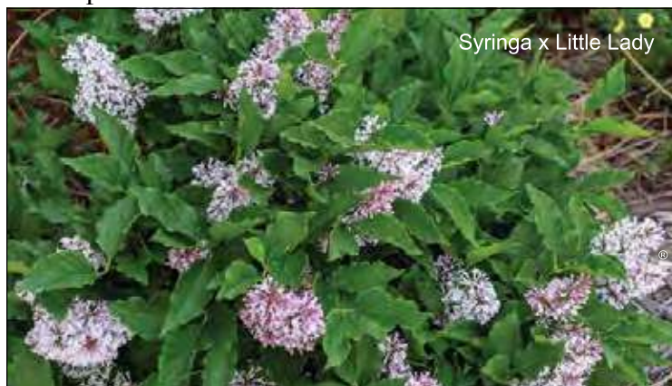
Syringa x Little Lady