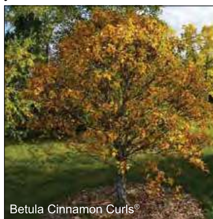
Betula Cinnamon Curls®

Halesia 'Jersey Belle' (Carolina Silverbell) is an excellent understory tree with bright white, bell-shaped flowers in spring before the foliage emerges. It grows slowly to 25' tall and 20' wide. We have had one growing in our gardens for several years, but have had trouble finding any to sell. Finally got our hands on a couple this year.