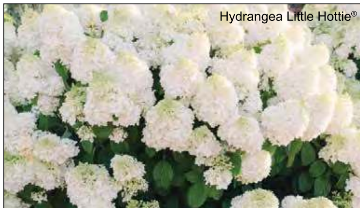
Hydrangea Little Hottie®

I'm always a sucker for yellow foliated plants that glow in the landscape. Cotinus Winecraft Gold® is a smokebush that has leaves that emerge orange, then turn bright yellow, and finally bright chartreuse for the summer. The typical pink, smoky plumes appear in early summer. It grows 4-6' tall and wide, much smaller than the conventional smokebush.