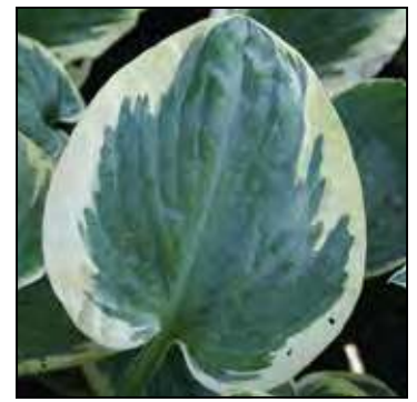
Hosta 'Snow Cap'