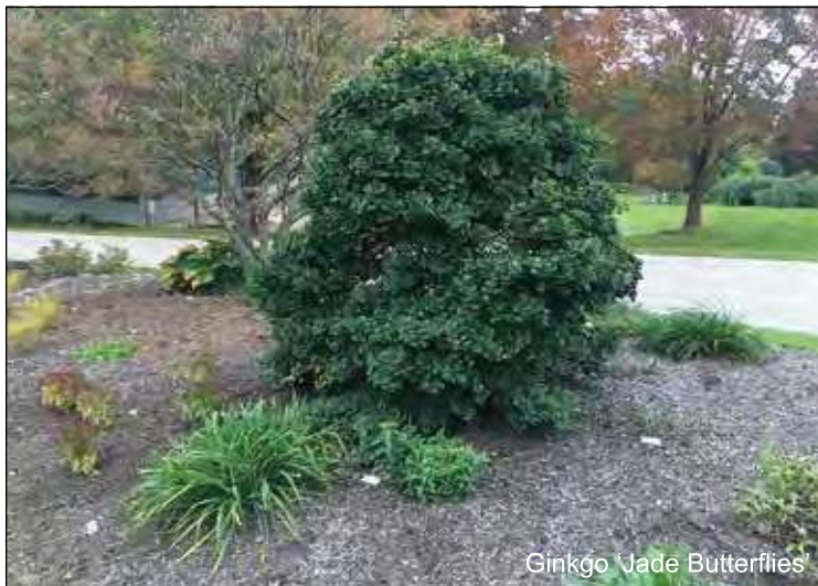
Ginkgo 'Jade Butterflies'

We finally have a few decent sized plants of Ginkgo 'Jade Butterflies' coming in this spring. There is a beautiful, mature specimen growing in our gardens, but it has been a plant that is hard to find in a good size. It is a dwarf, shrubby form of ginkgo with unique, butterfly wing shaped foliage. It generally is described as having bright yellow fall foliage, but our specimen has not done that so far. It is still one of my favorite plants in our sunny gardens because it is so interesting, hardy, and unique.