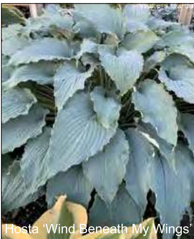
Hosta 'Wind Beneath My Wings'

Hostas: Rippled and wavy leaves is the theme of several new hosta varieties this year. 'Dancing with Dragons' (what a great name!) is a medium blue hosta with heavily rippled margins that holds its color well throughout the season. Its overall wavy presence makes this beauty appear to be dancing in the garden. If you have room for a giant, consider 'Drop-dead Gorgeous' . Large, ovate green leaves with bright yellow, rippled margins have a lightly wavy overall effect. Grayish streaks appear where the margin and center color overlap. A must-have, showy specimen for the shade! 'Wind Beneath My Wings' , another giant, is a majestic blue hosta with incredibly large ruffled foliage. A couple of smaller options with deep purple flowers are 'Party Streamers' and 'Time in a Bottle'. 'Party Streamers' forms a small, fast-growing mound with narrow, wiggly yellow leaves. 'Time in a Bottle' is a medium with moderately wavy foliage that emerges bright yellow in spring and becomes more chartreuse throughout the summer.