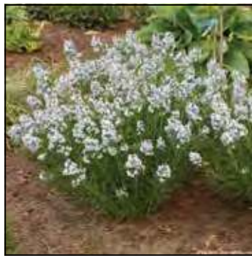
Amsonia 'String Theory'