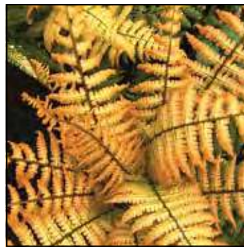
Dryopteris 'Jurassic Gold'