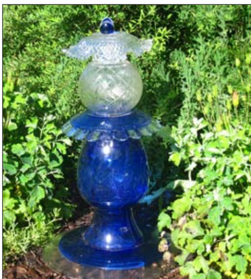
Blue Garden Lady

for best selection. The daylily season is much longer than the iris season. Some of the varieties will start blooming by the middle of June, and some don't start until late July.