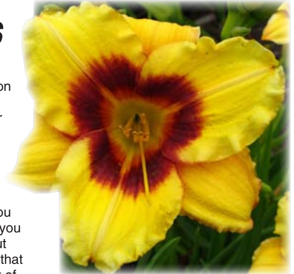
Oglesbee, IL, Daylily

We have to hold back enough of each variety for propagation and to fill orders for divisions, so the number of clumps available for any given variety will depend on our supply. In many cases, we can only spare one or two clumps of a variety. So get here early