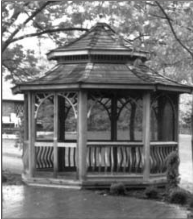
12' Victorian Gazebo with Double-Curved Roof, similar to the 16-footer constructed at Hornbaker Gardens.

We were already running short of space for the hostas, and since we have added around 50 new varieties just this year, we desperately needed more retail display space.